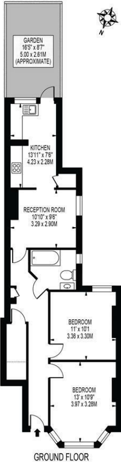
GROUND FLOOR FOR ILLUSTRATION PURPOSES ONLY

QUICKS ROAD APPROXIMATE GROSS INTERNAL FLOOR AREA: 682 SQ FT - 63.36 SQ M